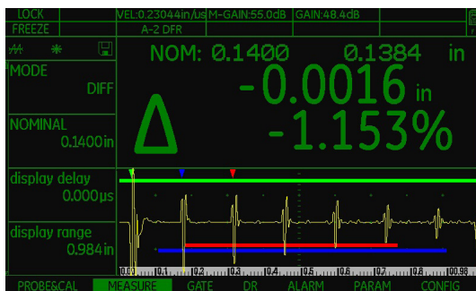
Differential value display