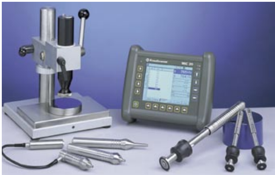
"Hardness testing as a twin pack": The MIC 20 with a selection of rebound impact devices and UCI probes, as well as with the quick support including motorprobe.

The MIC 20 makes for example the calibration easy for you. The setting parameters are then simply filed and recalled by pressing a button or by a "click" in the corresponding application case.