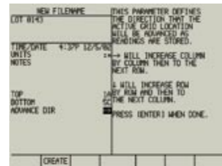
Creating the data file