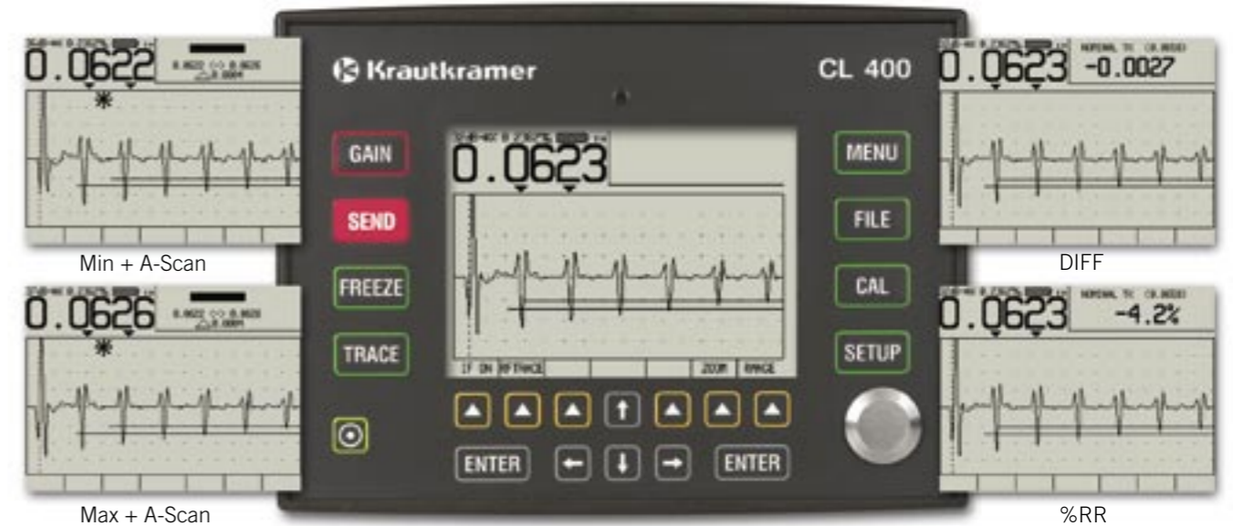
A-Scan option provides a variety of views beyond the above THICKNESS + A-SCAN View

The basic CL 440 Model is the cornerstone for constructing a solution that meets your exact needs by adding the options of displaying an A-Scan or Data Recorder. One or both can be installed at the time of purchase or can be retrofitted later as your testing requirements change.