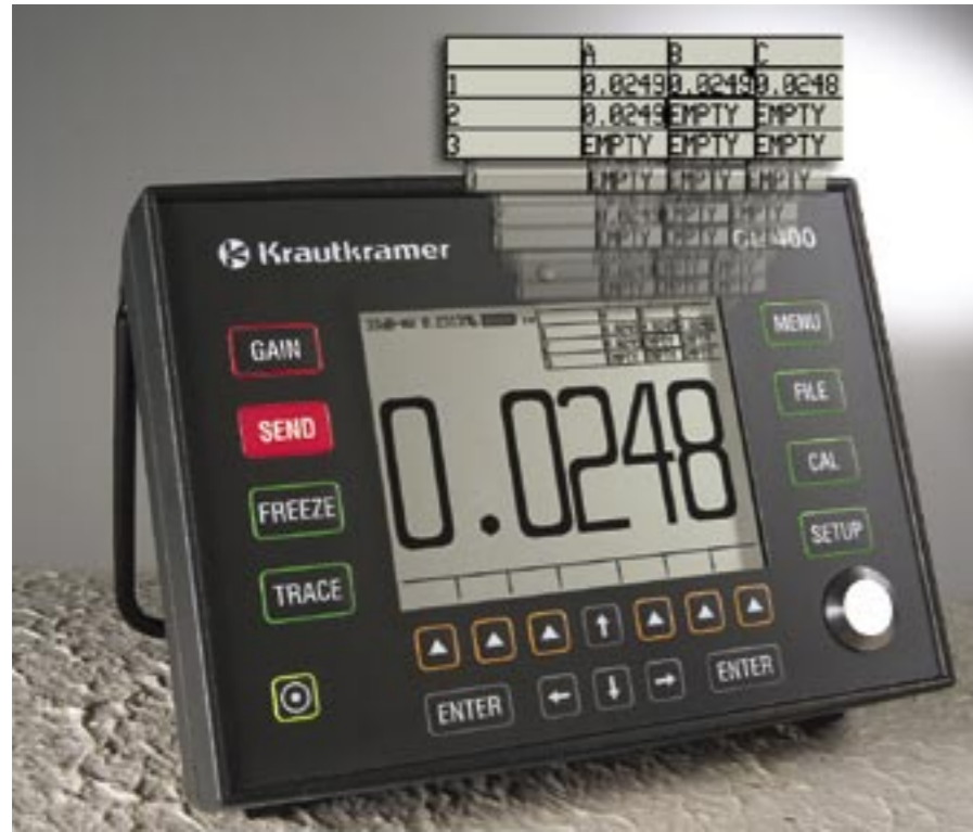
Data Recorder Window

UltraMATE® is a 2-way communication tool. You can use the software to transfer and store a Custom Setup that was created from one CL 400 instrument to another. UltraMATE® also provides a quick alternative for creating a Data Recorder file. Instead of using the CL 400's keypad, create a data file using UltraMATE® and then download it.