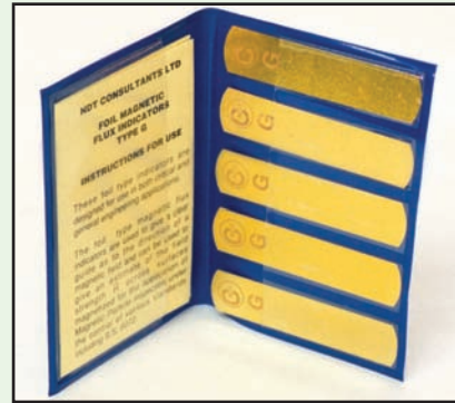
MG01/MG02 - Magnetic Field Strips Type 1 (G) and Type 2 (A)