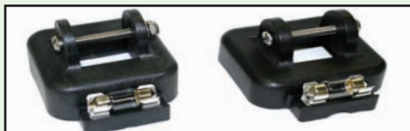
Y300/Y400 - Parker Induction Yoke Lights. Fits Parker B100, B300 and DA400 Contour Probes.