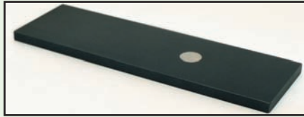
NA16 - Notch Defect Test Bar. For Compliance with MIL-STD-271 and NAVSEA-TB-T9074...