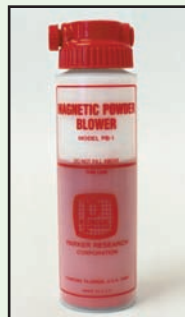
PB1 - Magnetic Powder Blower Apply Mag Powder in any direction.