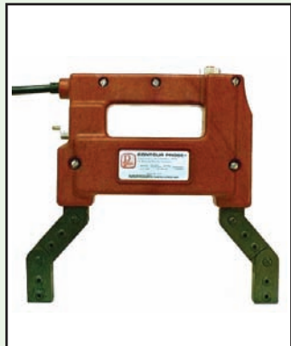
DA400 - Contour Probe. Most popular A.C./D.C. Yoke. Available in various Kit forms. Y400 Yoke Light additional.