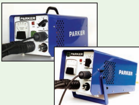
DA750 & DA1500 - Portable Mag units. Heavy duty 750 or 1500 AMP. Available with all accessories.