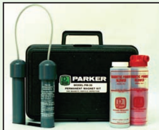
PM50 - Permanent Magnet Set. Available with Optional Kit.