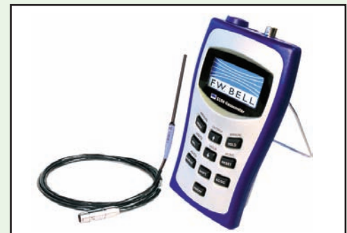
5170 & 5180 Gauss/Tesla Meters