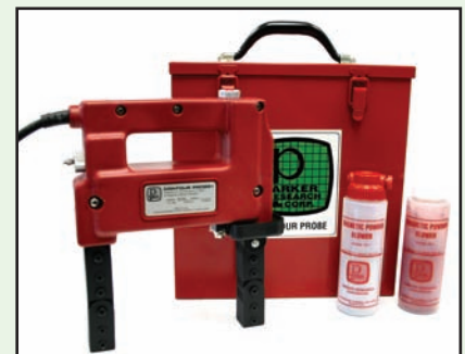
DA-400 Shown With "A" Kit items. Kit items are available with dry powder and Wet Fluorescent inspection mediums. Including Black Light and Steel Carrying Case.