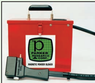
PB5 - Magnetic Powder Blower Self contained with internal Five Pound Powder Reservoir and Compressor. Apply powder evenly to all surfaces.