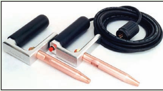
MA7000 - Prod Sets, Prod Replacements, Cables For all Portable Mag Machines