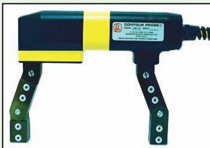
UW115 & UW12 Underwater A.C. and D.C. Yokes.