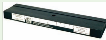
TB10 - Magnetic Weight Lift Test Bars. W/Certs Available in Single, 3, 4 or 5 Bar Sets. TB10-SP - 10-Lb Bar with artificial defects