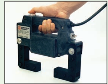
A210 - Heavy Duty A.C. Contour Probe. Strongest A.C. Field Yoke available. Model DA200 available for A.C./D.C. Operation.