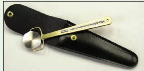
MG50 - Magnetic Pie Gauge W/Certs