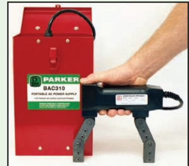
BAC310 - Portable, Stand alone Battery Inverted 115VAC Power Supply. Operate A.C. Yokes or other Instruments where normal power sources are unavailable.