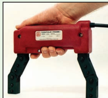
B100 - Our most economical A.C. Contour Probe. Available in 115VAC and 230VAC. May be ordered with the Y400 Yoke Light at extra cost.