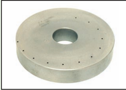
KS100A - Ketos Ring - AS5282 Certified