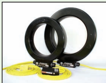
PL8 & PL10 - Magnetizing Coils. 8" & 10" I.D. Complete with Carrying Case.